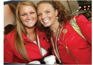
Fun & Friends