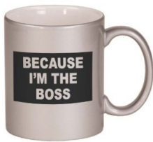
Be Your Own Boss