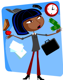
Priorities & Values