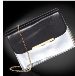
Prizes & Awards